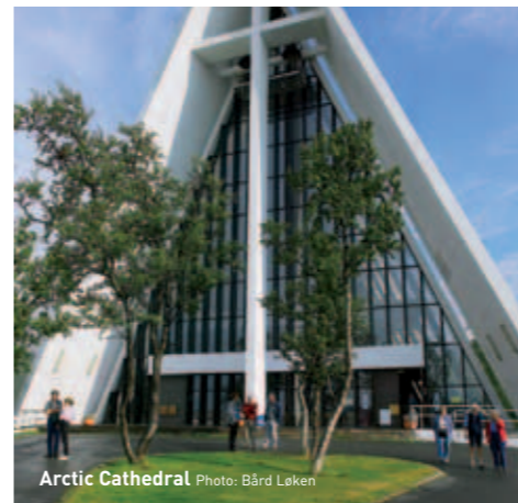
Arctic Cathedral

Blåst – world's northern most glass hut! Distance: In the city centre Duration: 1 hour. Capacity: 20 Blåst is an open workshop where you can get a glimpse of how glass is made. Like magic, glass is formed into fantastic products that make great gifts, or as a reminder to yourself.