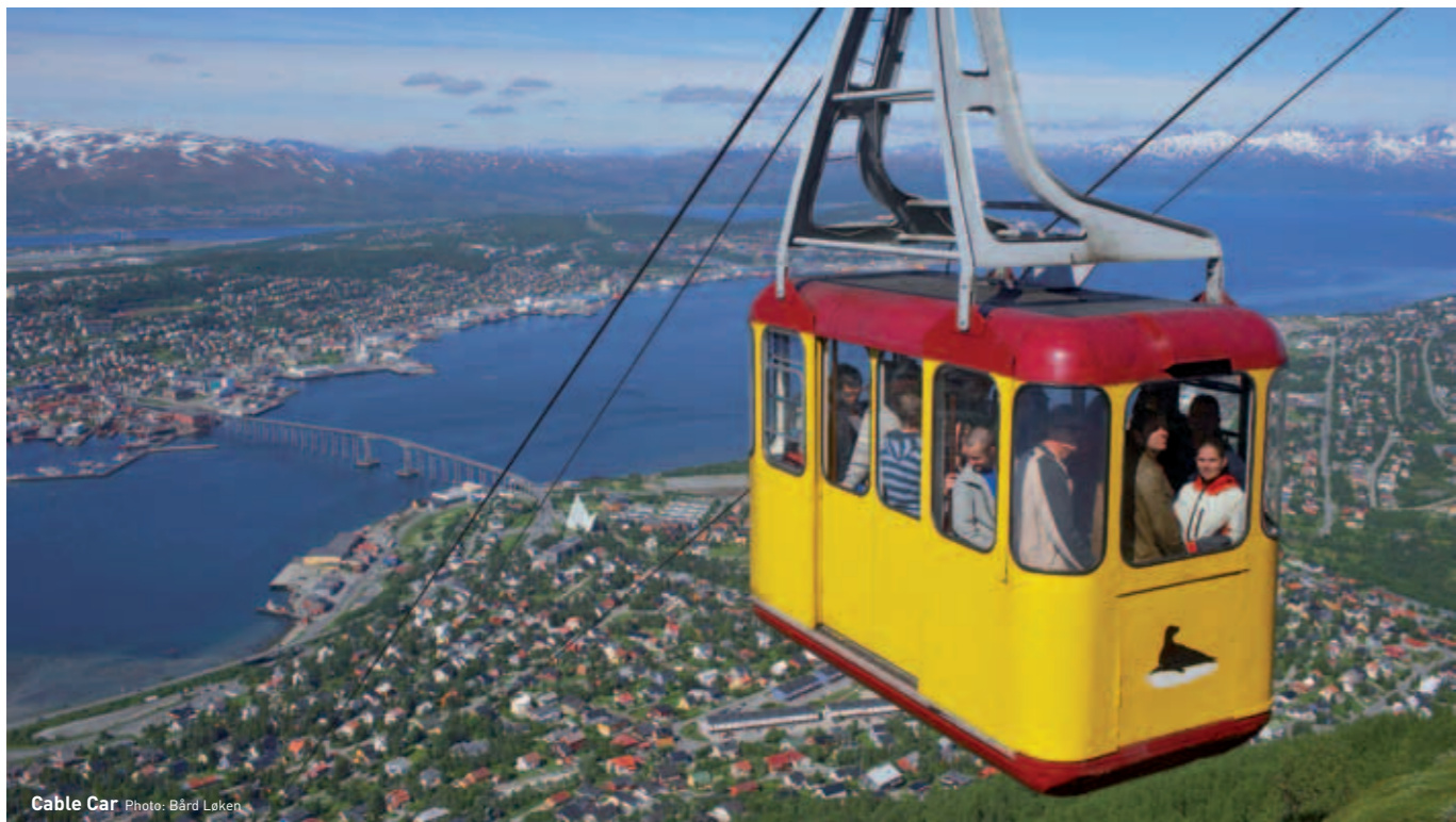
Cable Car